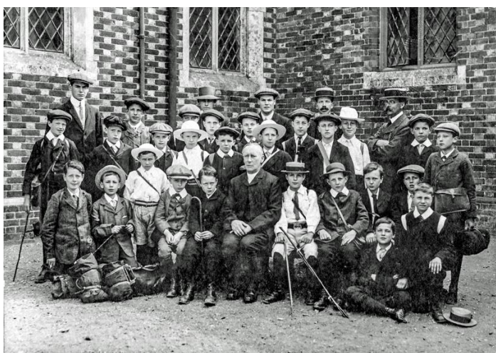
Wimborne School Boys off on Walking Tour